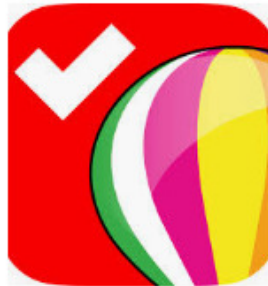
Onebillion-Aged 3-5 or Aged 4-6