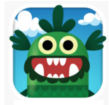
Teach a Monster how to Read