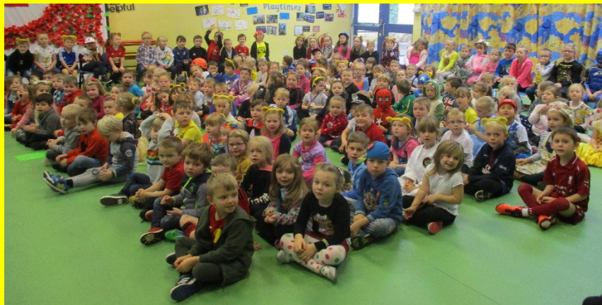
Playing football or doing Sporty things