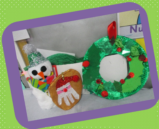
Look what Classes 1 & 2 made...

Our Christmas Fayre was really busy. Lots of visitors came, including SANTA!!! We all made decorations and gifts for our families... We hope you liked them!