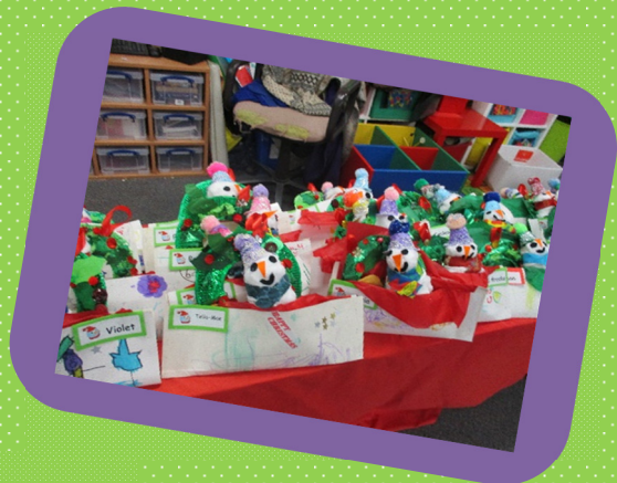
They were gorgeous!