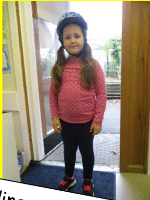
Riding my bike