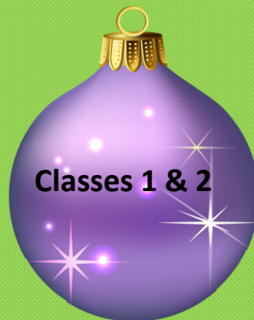
Classes 1 & 2