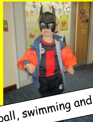
Football, swimming and being batman!